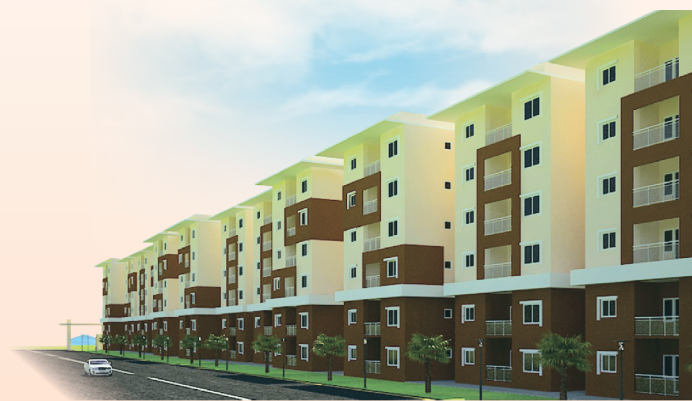
EAST SIDE RESIDENCY Pocharam, Hyderabad 750 flats on 6 acres