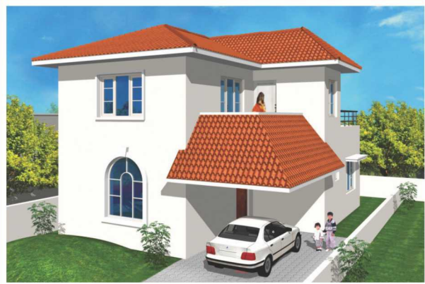
TYPE - B