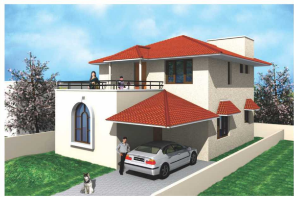
TYPE - A