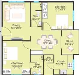
Type - C 950 Sft