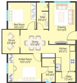
Type - D 950 Sft