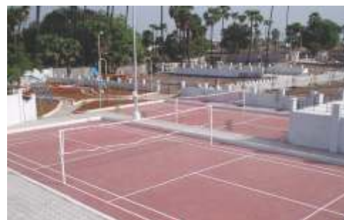
Actual Pictures of Current Projects