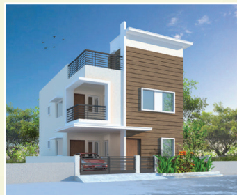
Villa Type - C2